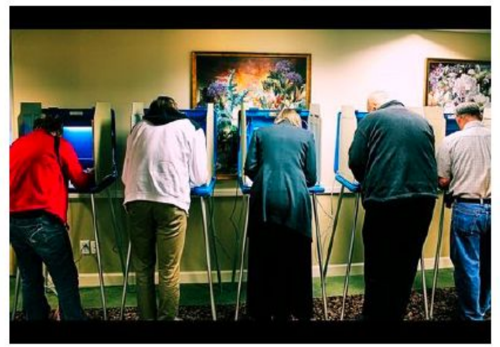
Phil Roder (CC BY 2.0)

When people vote, they make a choice. For example, they vote to choose the men and women in the United States Congress. These men and women make the laws that govern the country.